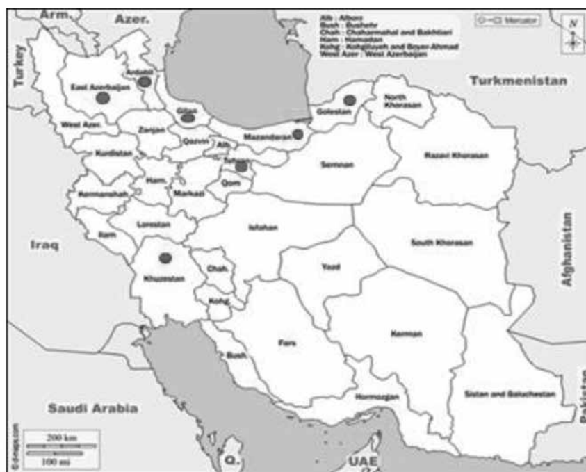
Fig 2. Ganoderma species dispersal in Iran

the RAPD-PCR technique, unveiled a wide spectrum of diversity, with inter-specific diversities of 61.48 and 40.16 observed for the laccate species G. lucidum and G. resinaceum , respectively (Keypour et al., 2019). Ariffin et al. (2000) suggested that the heightened genetic diversity observed in Ganoderma species may be attributed to their adaptation to a broad range of host organisms, a characteristic that is also evident in Ganoderma species collected from Iran (Table 1 and 2). The extensive genetic diversity observed in laccate Ganoderma species collected from Iran, as reported by Keypour et al. (2019), confirms the finding that a diverse array of tree species across various regions of Iran are susceptible to laccate Ganoderma infections. This underscores the significance of early-stage disease management in promoting forest survival and preservation. Biodiversity and host relationship