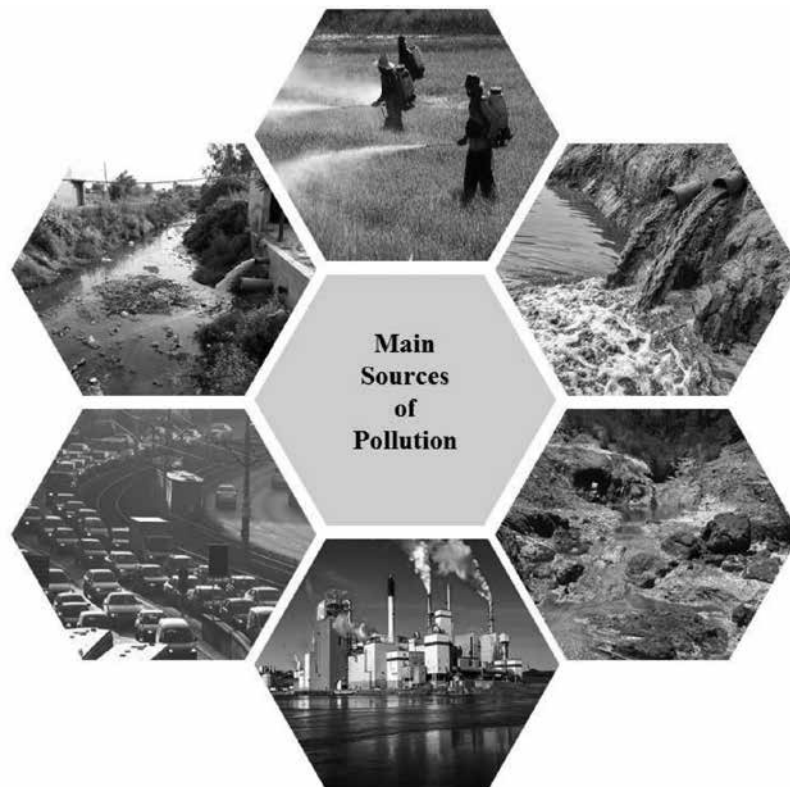
Fig. 1. Main sources of soil and water pollutants, including pesticides and insecticides, refining and smelting industries, automotive industries, mining, fossil fuels, sewage sludge, and household activities. Pictures used in this figure are adopted from (Di Capua, 2013; Khan, 2022), ( https://commons.wikimedia.org/ ), ( https://www.brainhealth.scot/ ), ( https://iglobalpunjab.com/ ), and ( https://truthout.org/ ).

Phycoremediation, the application of algae to remove contaminants from the environment, is recognized as an effective and affordable bioremediation technique. Microalgae are recognized as effective bioremediation agents in soil due to their rapid growth, large surface area, strong affinity