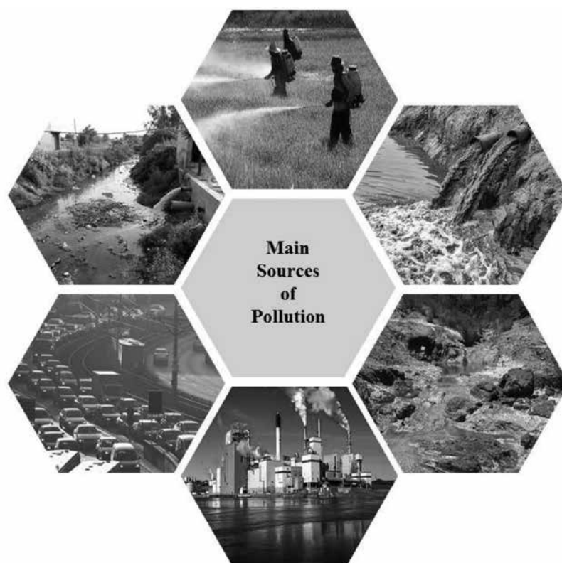
Fig. 1. Main sources of soil and water pollutants, including pesticides and insecticides, refining and smelting industries, automotive industries, mining, fossil fuels, sewage sludge, and household activities. Pictures used in this figure are adopted from (Di Capua, 2013; Khan, 2022), ( https://commons.wikimedia.org/ ), ( https://www.brainhealth.scot/ ), ( https://iglobalpunjab.com/ ), and ( https://truthout.org/ ).

Phycoremediation, the application of algae to remove contaminants from the environment, is recognized as an effective and affordable bioremediation technique. Microalgae are recognized as effective bioremediation agents in soil due to their rapid growth, large surface area, strong affinity